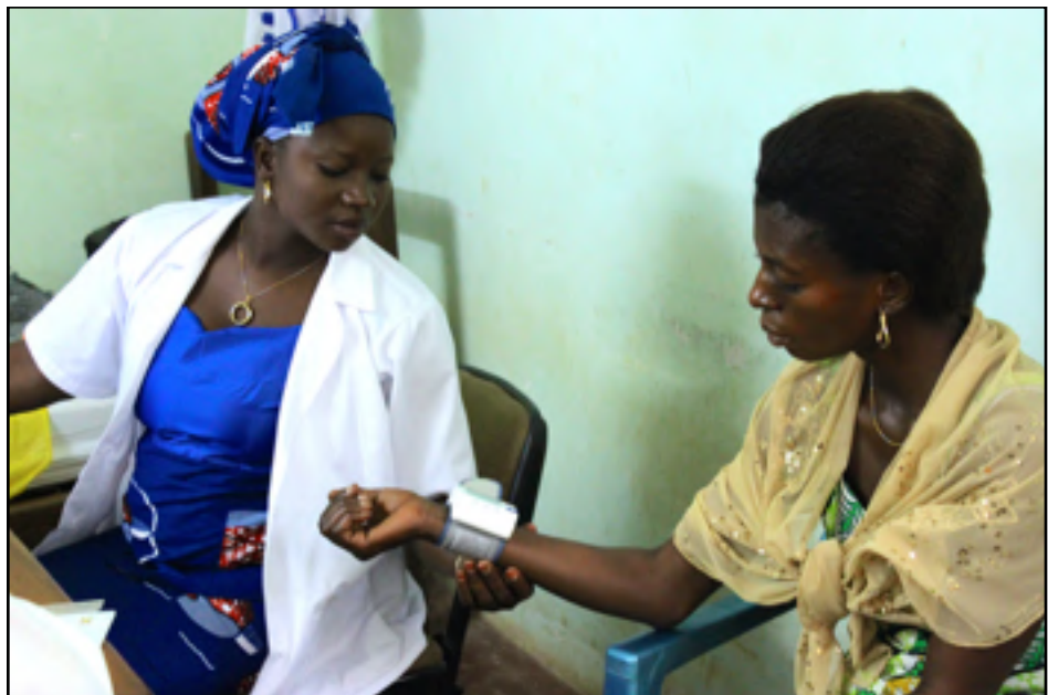
A nurse’s assistant checks a patient’s vital signs before a consultation.

Hope Through Health is in the process of working with various partners to analyze the data collected. This information will shed light on current health seeking practices, as well as the major barriers to and facilitators of accessing healthcare in northern Togo. This information will also be used by Hope Through Health to inform the design and implementation of future interventions and significantly enhance our ability to respond to and improve upon existing challenges. We would like to thank the incredible student team from the NYU Global Institute of Public Health for their hard work on this project, as well as Hope Through Health’s own Fulbright Scholar for her tireless energy and leadership. We look forward to continuing to share updates on our ongoing research and evaluation efforts.