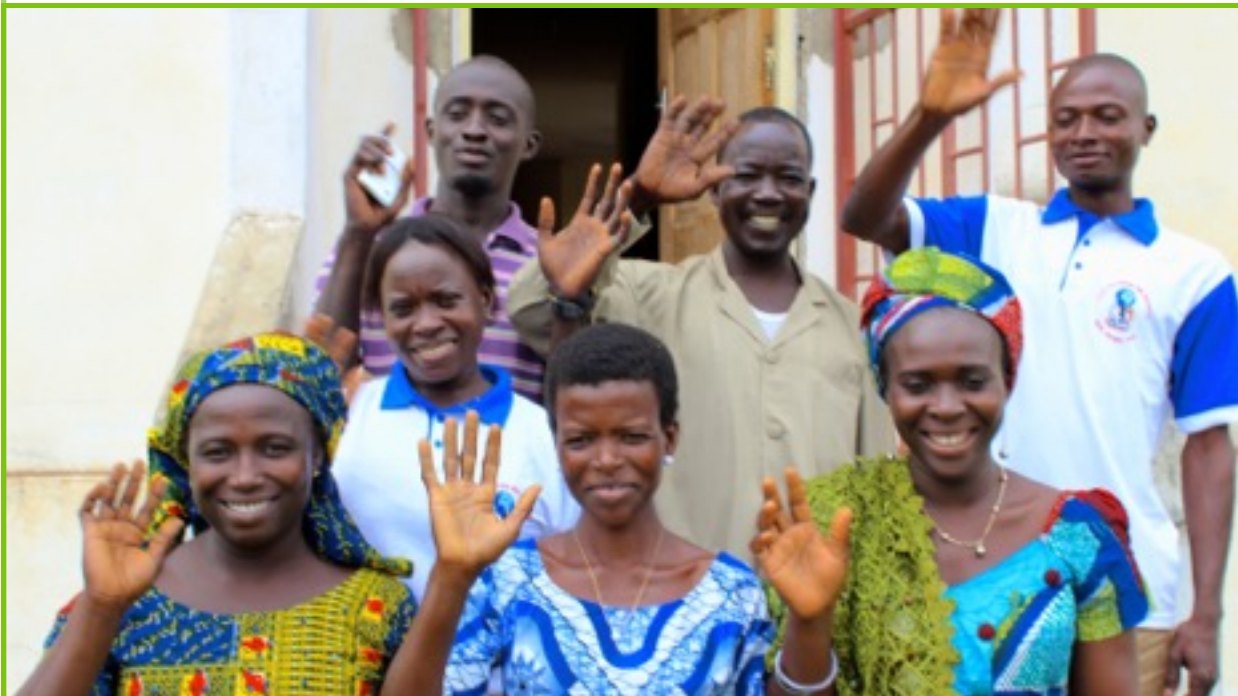
A thank you wave from the Community Health Worker team at Hope Through Health